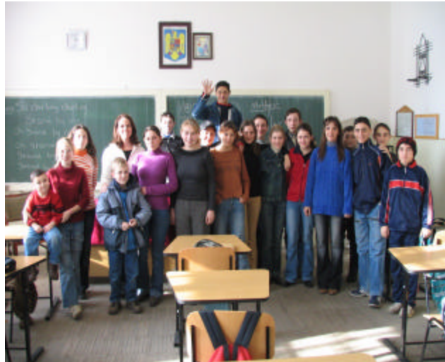
One of the middle school classes visited